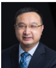
Guoqing Chang Institute of Physics Chinese Academy of Sciences